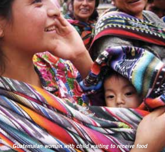
Guatemalan woman with child waiting to receive food