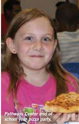
Pathways Center end of school year pizza party.