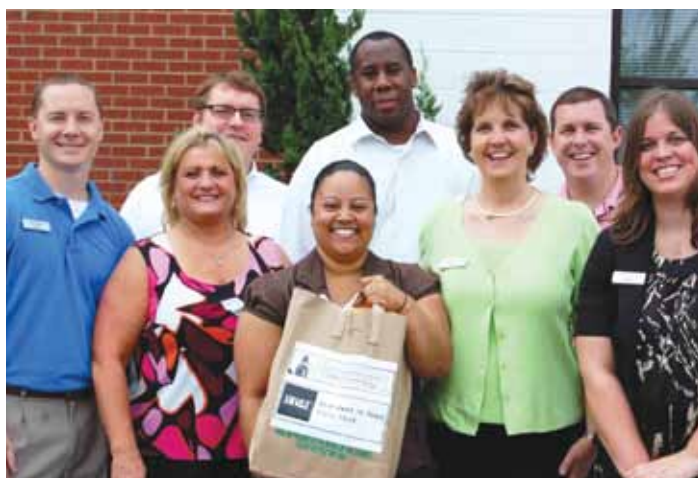
BB&T served 200 EAP clients/guests with 100 emergency food bags.