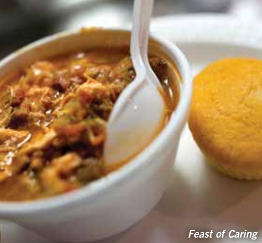
Feast of Caring